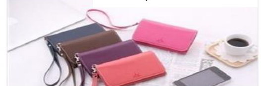
Cell Phone Wallet Clutch 73% Off Cell Phone Wallet Clutch